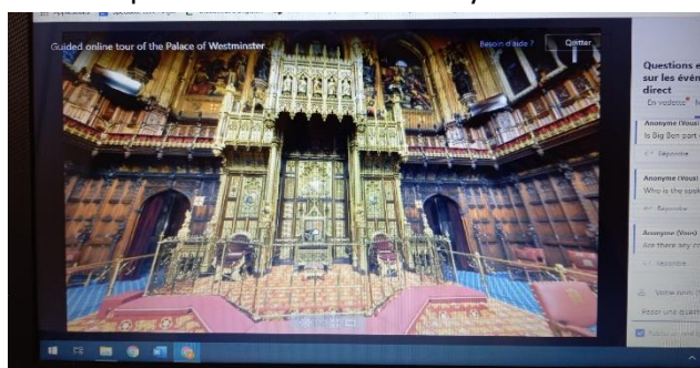
The seat of the Queen in the House of Lords

These online visits are available in February and March, you simply need to register there: https://ukparliament.seetickets.com/tour/guided-online-tour-of-the-palace-of-westminster